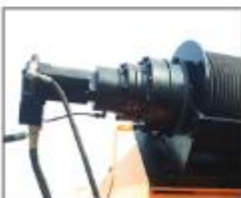
HYDRAULIC WINCH OF 12T

Ergonomically designed spacious cabin with modern dashboard for utmost operator comfort and operation.