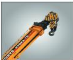
SLOTTED BOOM AND ROPE

Compensation for precision handling & auto leveling of loads.